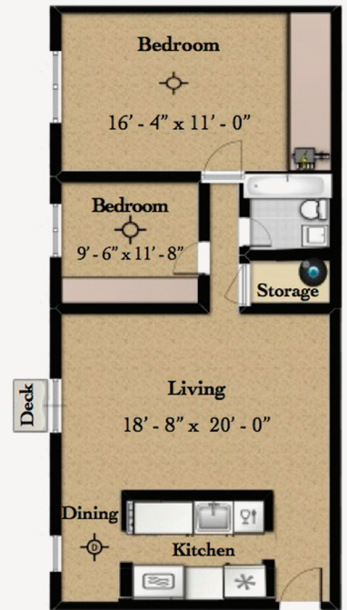
Two Bedroom Unit Starting at 874-889 sq ft.